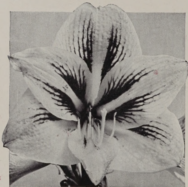
AMARYLLIS, Giant Hippeastrum

MINIMUM MAILING AND PACKING CHARGE 10c on any item, additional charges are made on heavier shipments. Large shipments will be made Express collect. Shipping charges subject to government changes of tariff, etc.